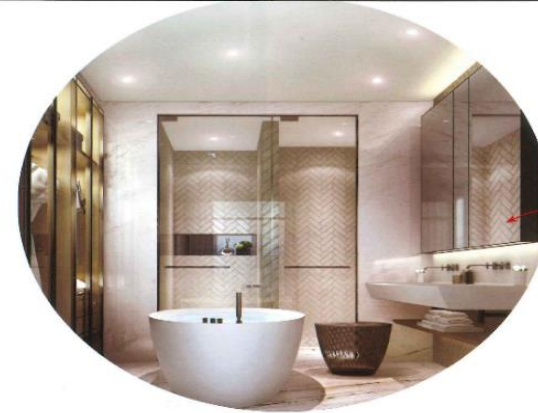
The sumptuous interior of the master bathroom includes a built-in wardrobe, a spacious shower area as well as a stand-alone bathtub. According to Leung, this design was meant to evoke feelings of staying at a luxury hotel.

"Unlike other developers who will consult with us only after the building is halfway or almost complete, KSK Land wanted us involved from the start while the project was still on the drawing board. This allowed us to provide additional feedback on what could be improved from an interior designer's perspective which is important, because design is not just about presenting some sort of luxury or add-on but also changes how we feel and interact with the world. And at the end of the day, we want those who do invest in 8 Conlay to be able to enjoy their space."