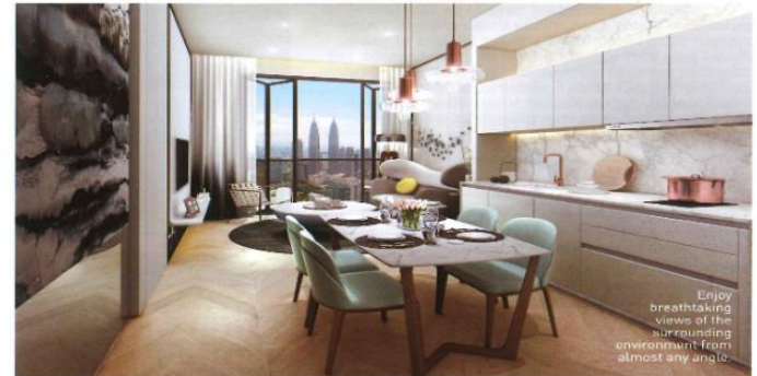
Enjoy breathtaking views of the surrounding environment from almost any angle.