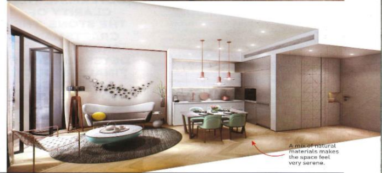
A mix of natural materials makes the space feel very serene.